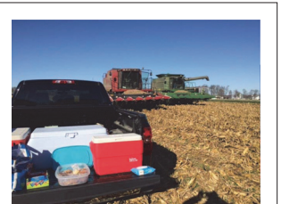
Photo of volunteers harvesting the Wollyung farm on November 12, 2016