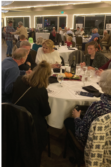
MCFB Memebers met at Creekside Golf Club for our annual meeting in November.