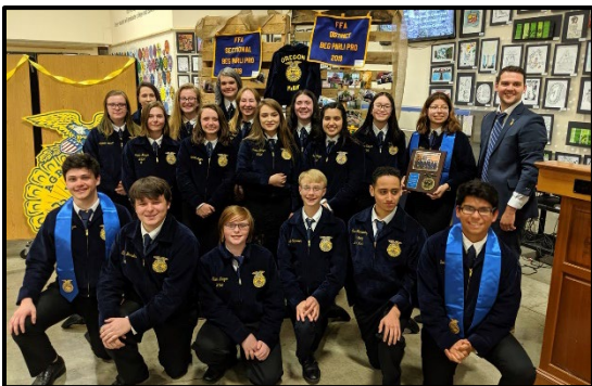
Above: 2019 McKay FFA class